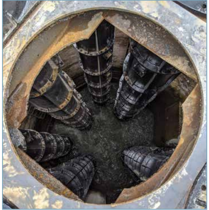
View from the last pump base plate porthole before the 7th and final pump was installed into the bypass pumping structure (Gate House Shaft).

Weiss Construction updated many elements of the existing pump station structure, so that this system will be newly designed to bypass incoming wastewater flow from the Detroit River Interceptor (DRI) to the Fairview Pump Station. The new design will now be able to pump from the 33-foot-deep gate structure upstream of the work area and temporary bulkhead, returning flows to the DRI through the north stop log chamber, located downstream of the pump station approximately 80 feet away. CS